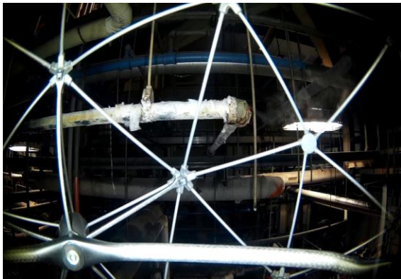
Steam leak view from UAV camera

With an on-board camera, the device captures footage in stunning Full High Definition , and its Thermal Imaging camera can detect issues not visible to the naked eye.